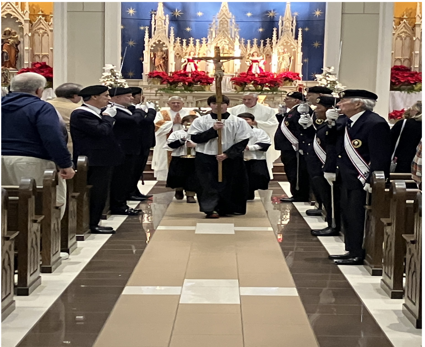
Honor Guard at the 6:00pm Mass on Christmas Eve at Holy Family Church. Thank You Sir Knights

On January 18th, there will be a Fourth Degree Exemplification at Our Lady of the Gulf Conference Center in Bay St. Louis. The Exemplification usually starts at 1:00pm.